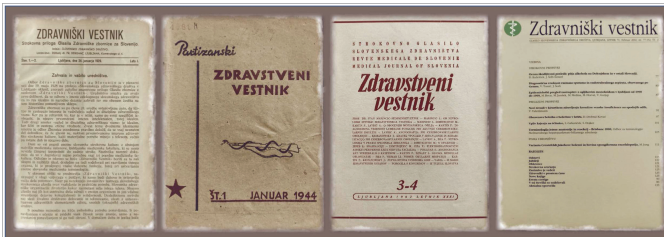
Figure 2: Covers of the journal through time: the first issue of the Medical Journal from 1929, the cover of Partisan Medical Journal from 1944, the cover of the Medical Journal from 1962 and the cover of the Medical Journal from 2002.

In 1941, after the 3rd published issue, they stopped