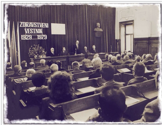
Figure 3: Celebration of the 50th anniversary of the Medical Journal publication.